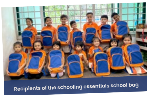
Recipients of the schooling essentials school bag