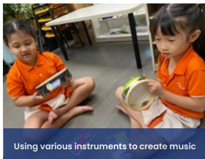
Using various instruments to create music

356 children benefited from You've Got Talent programme