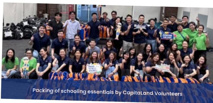
Packing of schooling essentials by CapitaLand Volunteers

CapitaLand Hope Foundation , a dedicated supporter of the Bright Horizons Fund, was hosted by one of our My First Skool centres in March 2024, to learn more about how the addition of socio-emotional modules foster the wellbeing of the children and reinforce executive functioning skills.