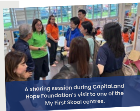
A sharing session during CapitaLand Hope Foundation's visit to one of the My First Skool centres.

We thank the CapitaLand Hope Foundation for their continued support, which helps us provide effective learning and build bright futures for our children in this programme.