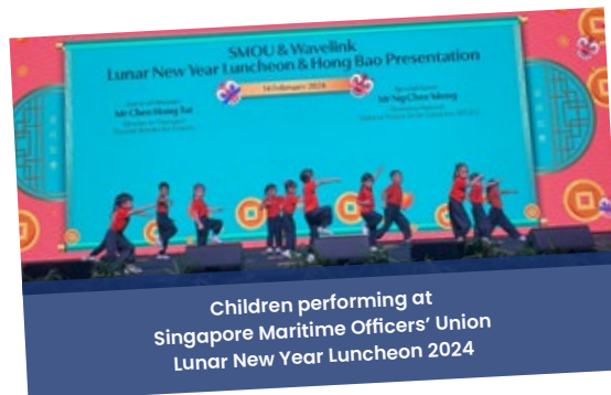
Children performing at Singapore Maritime Officers' Union Lunar New Year Luncheon 2024