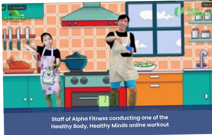
Staff of Alpha Fitness conducting one of the Healthy Body, Healthy Minds online workout

benefitted from the Healthy Body, Healthy Mind (HBHM) workshop in 2024